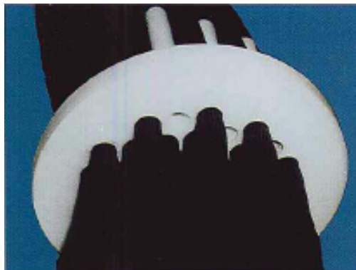
Clusters of thermally conductive tubing.

The heat of solution is absorbed through the wall by the cooling water.